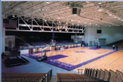
Timmons Arena Greenville, SC