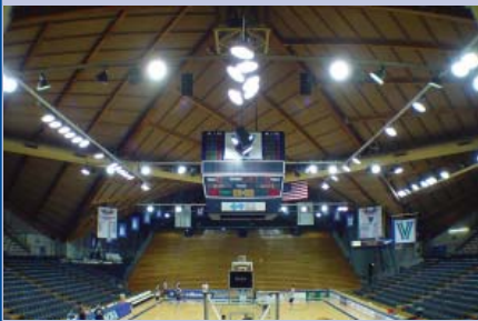
Villanova University Pavilion Villanova, PA