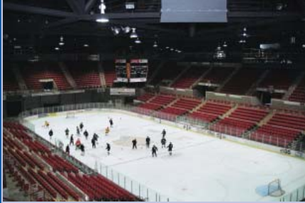
Kay Yeager Coliseum Wichita Falls, TX