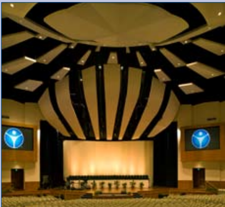
Mile Hi Church Lakewood, CO