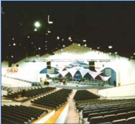
Christian Life Center Kalamazoo, MI